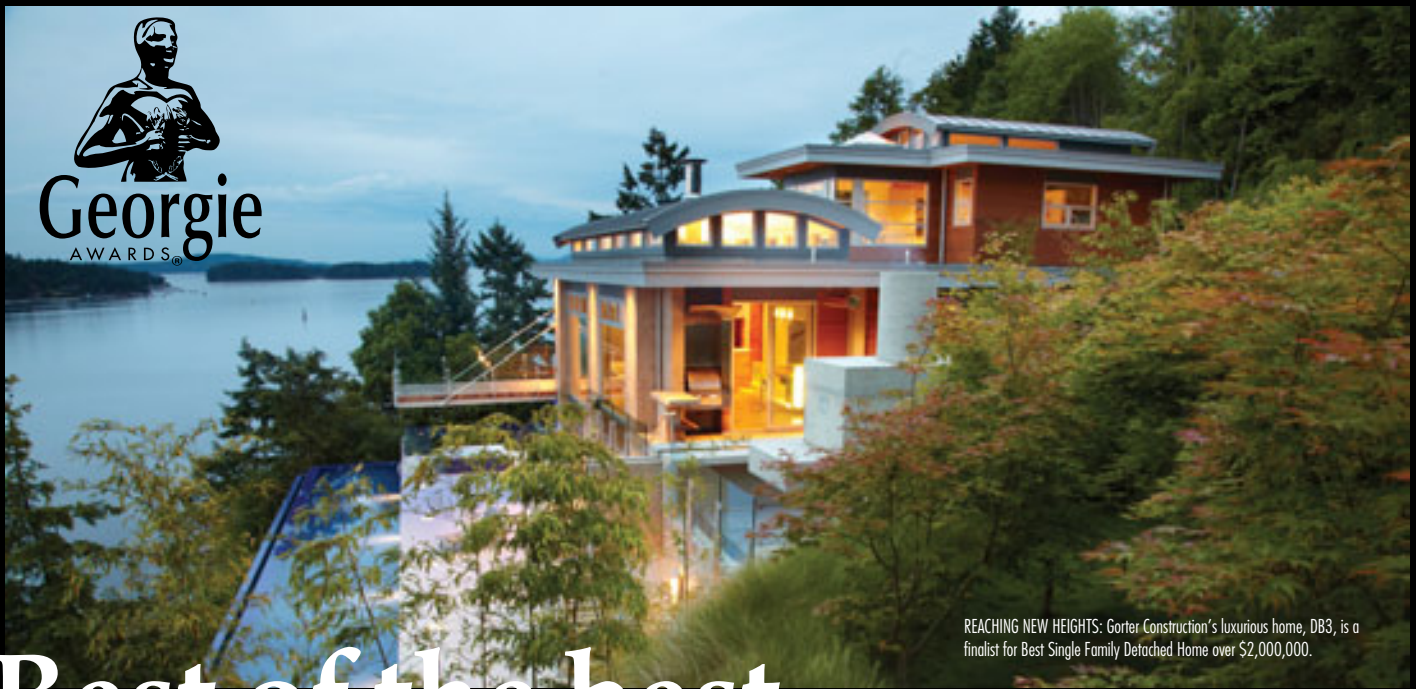
REACHING NEW HEIGHTS: Gorter Construction's luxurious home, DB3, is a finalist for Best Single Family Detached Home over $2,000,000.