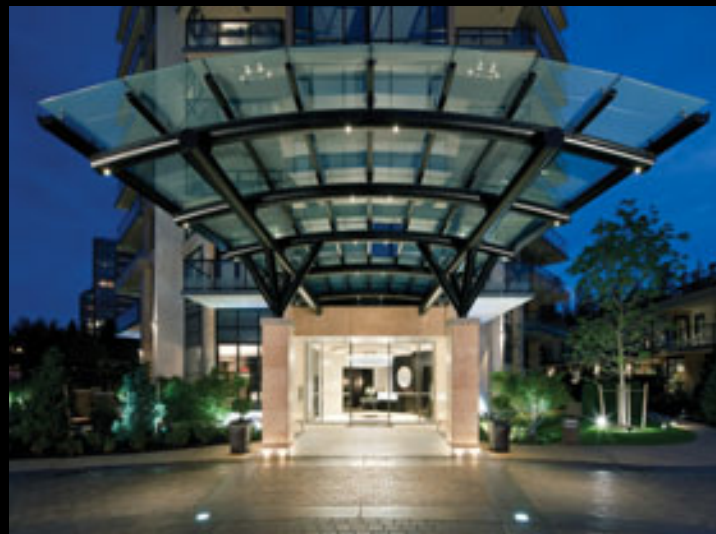
GEM OF A BUILDING: Boffo Development's Jewel tower, a finalist in several Georgie categories, overlooks Central Park in Burnaby.